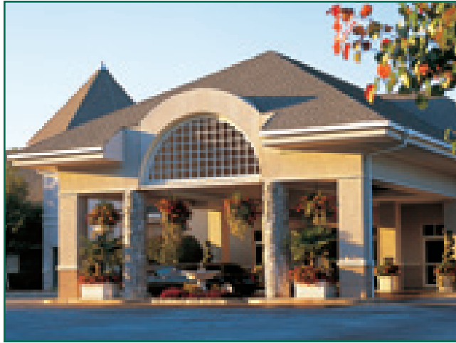
A welcoming entrance.

MAJESTIC. SERENE. UNCOMPROMISINGLY BEAUTIFUL.