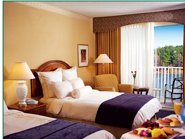
Most guest rooms feature lake views.