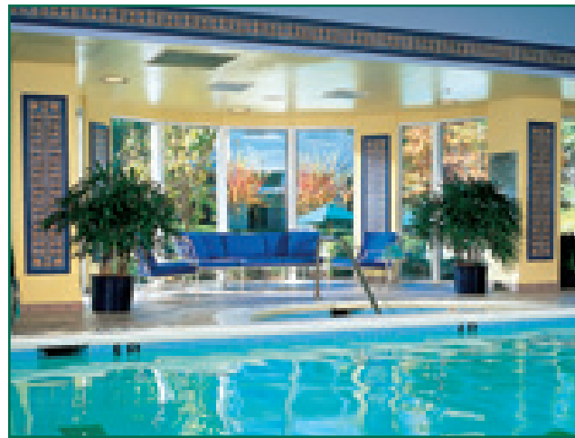
Our indoor pool allows for year-round swimming.