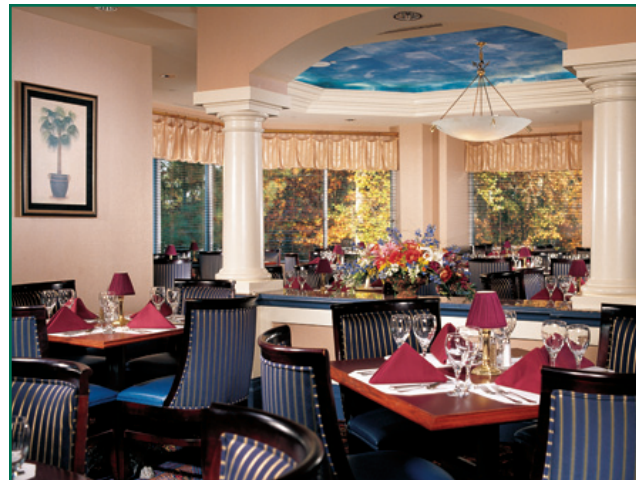
WATERSIDE offers beautifully prepared cuisine.